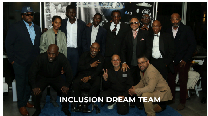
INCLUSION DREAM TEAM