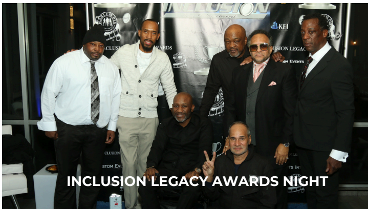
INCLUSION LEGACY AWARDS NIGHT